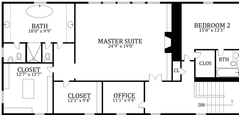
SECOND FLOOR ±1830